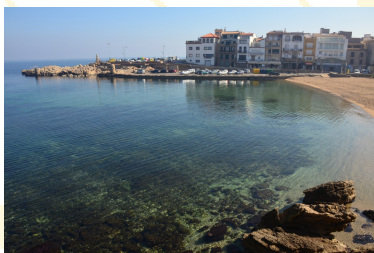
▲ "Les Barques" beach (l'Escala)

If you have further questions do not hesitate to contact webmaster@compositionaldata.com .